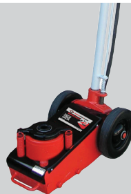
Model 522SD 22 Ton Super Duty Axle Jack