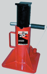
Model 3314 20 Ton Pin Style Safety Stand