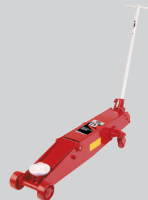
Model 3130 10 Ton Heavy Duty Service Jack

Guilderland Center, NY - 1-800-255-0555 - www.affjaxx.com