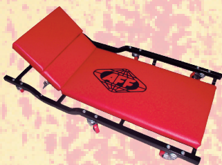
Model 3908 42" Mechanics Creeper