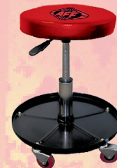
Model 3907 Air Piston Creeper Seat

Guilderland Center, NY - 1-800-255-0555 - www.affjaxx.com